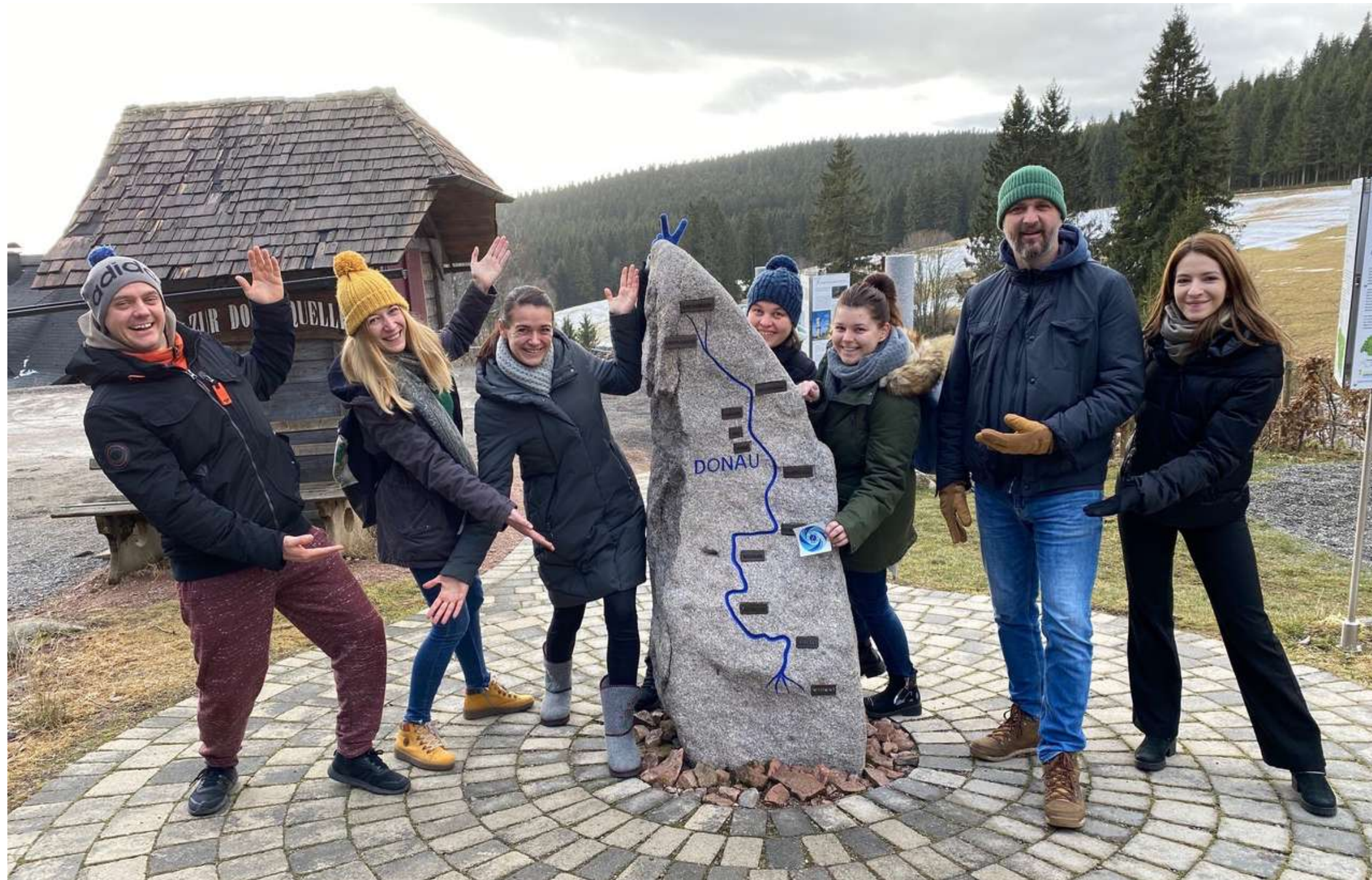
The core team